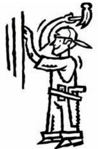
Handy Man Ministry

The Handy Man ministry team will not meet this Saturday. They will meet on Saturday, August 4 . If you would like to be a part of this ministry, meet in the gym for breakfast at 8 am August 4. After breakfast, the team has several projects they will be working on.