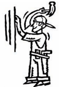
Handy Man Ministry

The Handy Man ministry team will not meet this Saturday. They will meet on Saturday, August 4 . If you would like to be a part of this ministry, meet in the gym for breakfast at 8 am August 4. After breakfast, the team has several projects they will be working on.