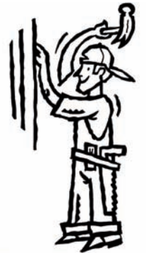
Handy Man Ministry

The Handy Man Ministry will be having its first meeting on Saturday, June 30. We will meet at the church building for breakfast at 8 am. After breakfast we will begin working on any known projects for the month. From then on we will meet the last Saturday of each month (same time, same place). The Handy Man Ministry welcomes any men and/or young men