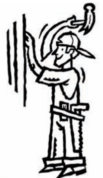
Handy Man Ministry

The Handy Man Ministry will be having its first meeting on Saturday, June 30. We will meet at the church building for breakfast at 8 am. After breakfast we will begin working on any known projects for the month. From then on we will meet the last Saturday of each month (same time, same place). The Handy Man Ministry welcomes any men and/or young men