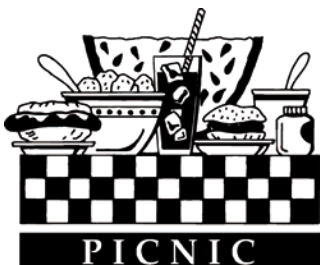
PICNIC IN THE GYM

We will begin our monthly Wednesday fellowship meals on June 27 before Bible class. Let's have a picnic in the gym. Bring your favorite picnic foods, sides and desserts. We will begin serving at 6 pm.